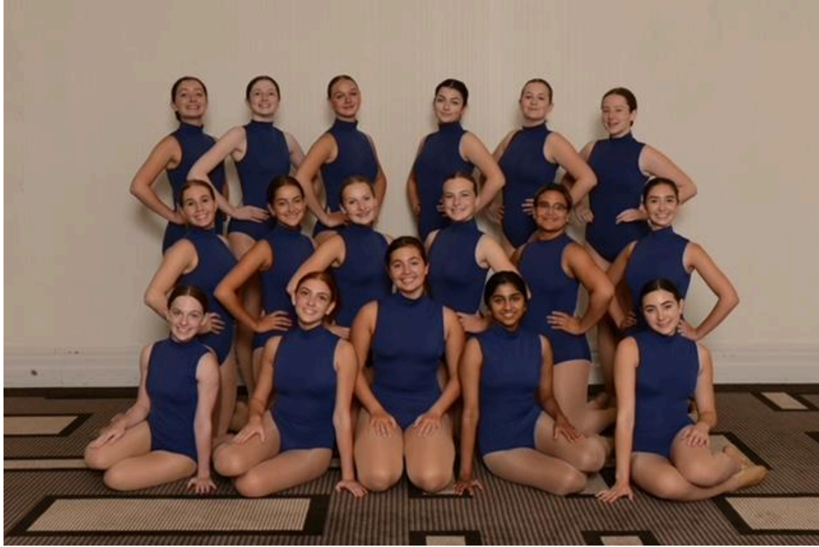
Class of 2023